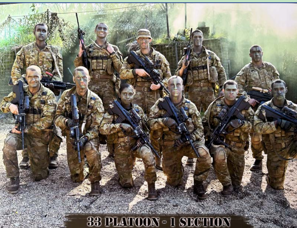
33 PLATOON - 1 SECTION