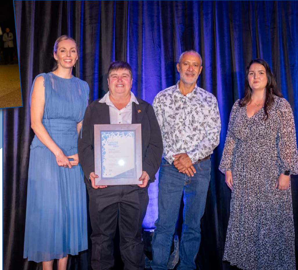
Top pic and bottom left pic thanks to Nugget, smoking ceremony & award pics thanks to...